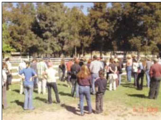
Part of the large group that attended one of the free field days at Brookleigh Estate in the Swan Valley.

Horse Land Water 'MANAGEMENT GUIDELINES' booklets and 'ACTION PLANNERS FOR HORSE PROPERTIES' are given out to attendees of the field days and these are full of useful information as well as allowing one to keep a log of your property management skills.